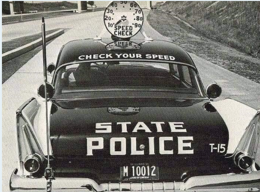
Tollway Speed Check Squad Car